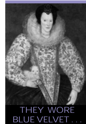
THEY WORE BLUE VELVET . . .

“She wore Blue Velvet,” crooned Bobby Vinton — not referring, we surmise, to Mary, Queen of Scots, who dressed her 22 lap dogs in blue velvet collars. Not to be outdone, her brother-in-law, the French king Charles IX, outfitted his 36 miniature greyhounds in red and green velvet collars.